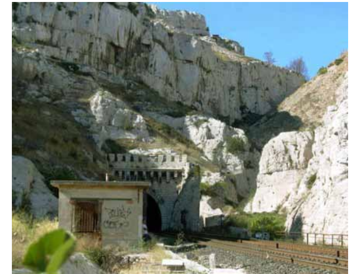
Fig. 5. Pavel Machotka (American, born Czech Republic, 1936–2019), “Viaduct at l’Estaque,” from Cézanne: Landscape into Art (New Haven: Yale University Press, 2014 [1996]), 93