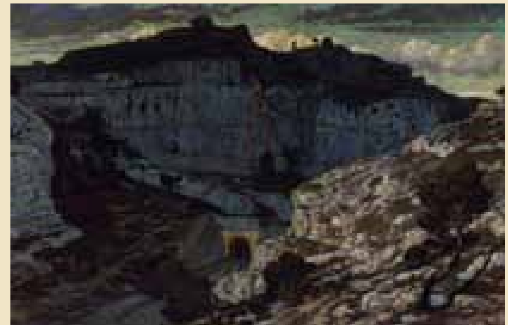
Fig. 4. Fabius-Germain-Joseph-Brest (French), Landscape of La Nerthe with the Rove Tunnel , 1848. Régie Culturelle Régionale Provence-Alpes-Côte-d'Azur