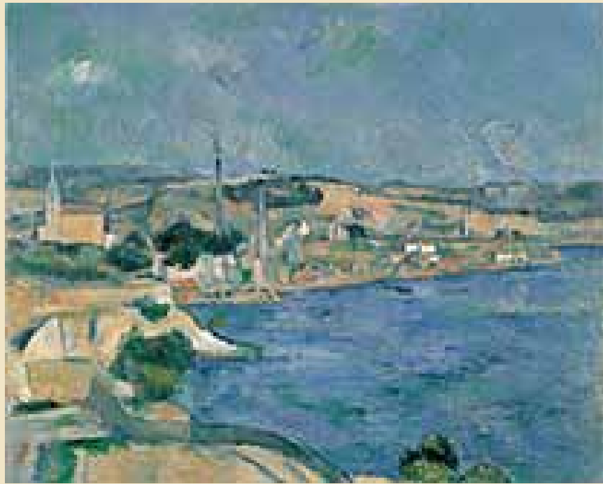
Fig. 2. The Bay of Marseille Seen from the Village of Saint-Henri , 1877–79. Oil on canvas, 66.5 × 83 cm. Yoshino Gypsum Co., Japan (FWN 118)

fig. 4). He would also physically turn away from the dense town streets and beguiling sea, and moved inland to explore on foot the rocky hills to the north.