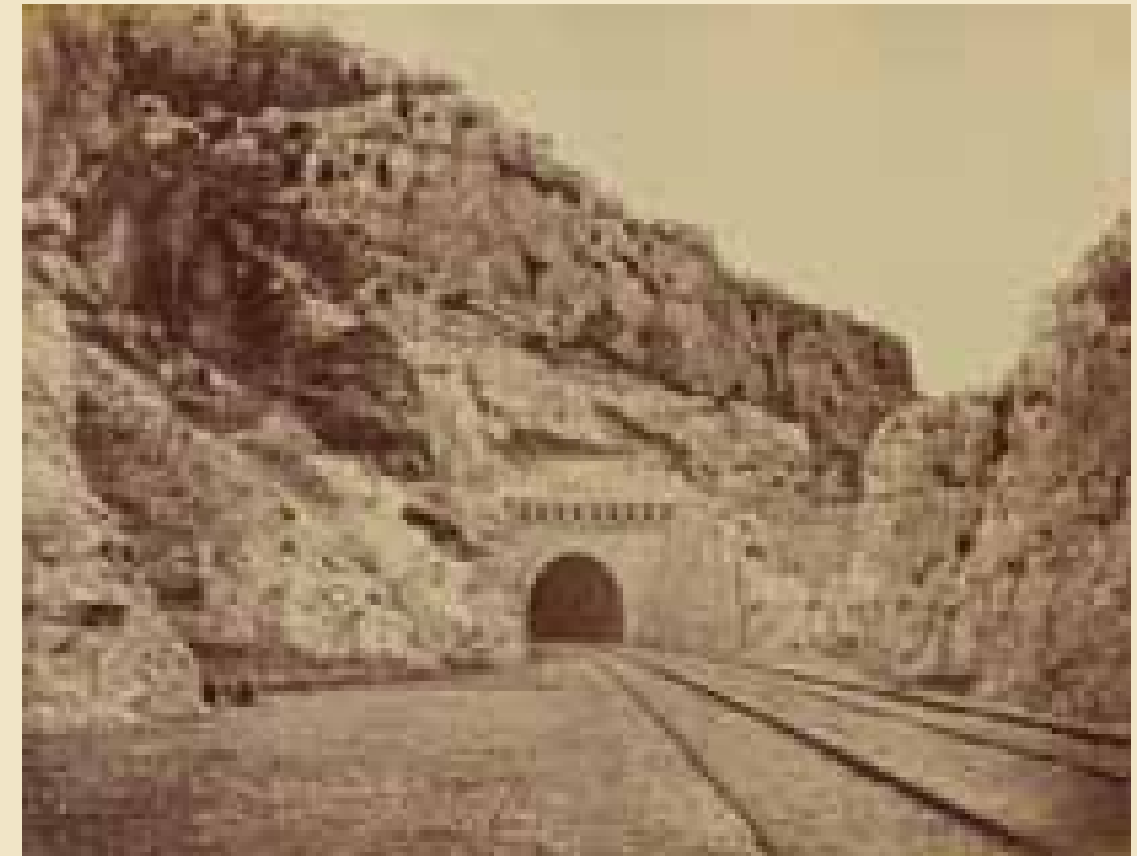
Fig. 3. Édouard Baldus (French, born Germany, 1813–1889), Souterrain de la Nerthe , ca. 1861. Albumen silver print, 32.7 × 43.2 cm. The J. Paul Getty Museum, Los Angeles