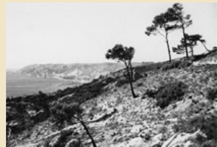
Fig. 1. View to the west above L'Estaque.

The pictorial inspiration on offer to do so—for an artist looking to paint the forms, light, and colors of his surroundings in his own way—was then plentiful, as the period in question coincided with remarkable growth in L'Estaque. From mid-century, largely thanks to technological advances in construction and transportation, the town's principal industries of fishing, tourism, and manufacturing were booming. 7 And the neighborhoods accommodating them were rapidly transforming to keep pace. Cézanne was not, however, drawn to these scenes of modernity, and largely minimized the traces of it within his compositions. In his multiple views of the bay, for example, he either balanced a factory's smokestack in the distance with a vertical from an earlier epoch, such as a church steeple (fig. 2), or emphasized natural elements—the pines or sea—to overshadow it entirely (see Iker 1.2,