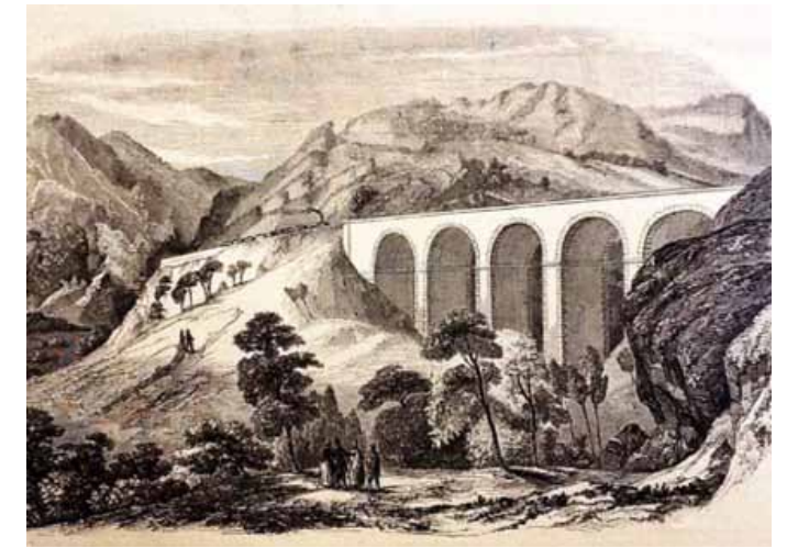
Fig. 4. “Chemin de fer d’Avignon à Marseille—Viaduc du Rio [sic],” L’Illustration (November 13, 1847)

Recently, the art historian Pavel Machotka produced a photograph that aligns even more closely with the Oberlin Viaduct at l'Estaque (fig. x). 18 In the photograph, as in the painting, stone scarp fills the frame, relieved only by sparse vegetation and a wedge of sky. Yet the photograph, unlike the painting, includes the entrance to the Tunnel de la Nerthe, implying that Cézanne occupied a slightly different vantage point in relation to his motif, or simply chose to exclude the opening of the tunnel altogether. Another conspicuous difference between photograph and painting is the presence, in the latter, of the viaduct in the immediate foreground. In his account of the Oberlin painting, John Rewald observes that Cézanne uses the strong horizontality of this viaduct to “thwart any attempt at ‘penetrating’ into the picture’s depth.” 19 But pictorial depth, continues Rewald, is precisely what Cézanne generates elsewhere in the composition with his diagonal brushstrokes and subtle shifts in palette and texture; each, he writes, leads the eye from the viaduct to the ridge, at once through and across the landscape. AI